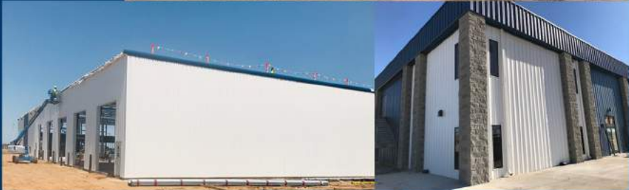
Above: Stage 4 - Facade