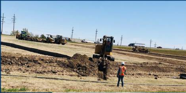
Left: Stage 1 - Dirt Work and Foundation